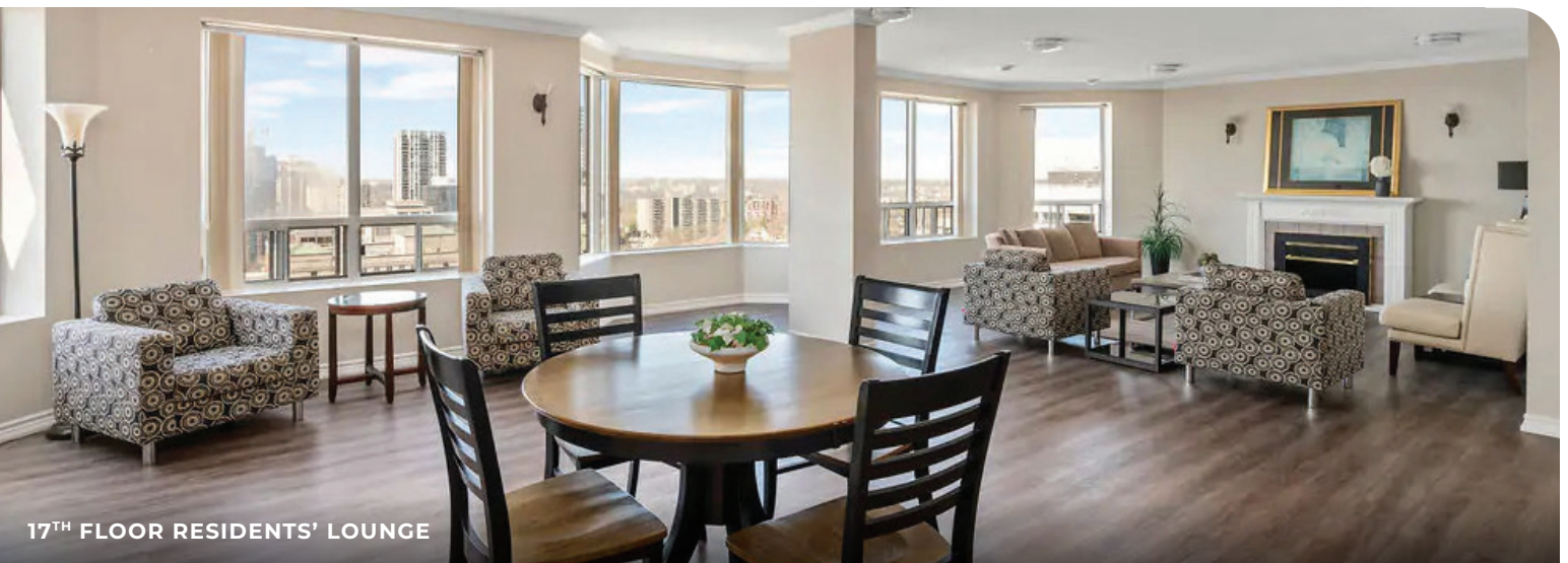
17 TH FLOOR RESIDENTS' LOUNGE

Take a short stroll to 18-acres of walking trails and greenspace