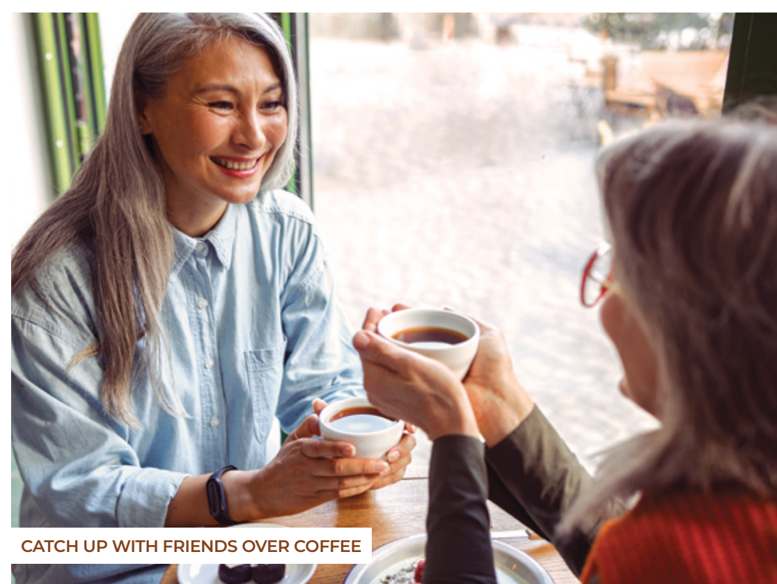
CATCH UP WITH FRIENDS OVER COFFEE