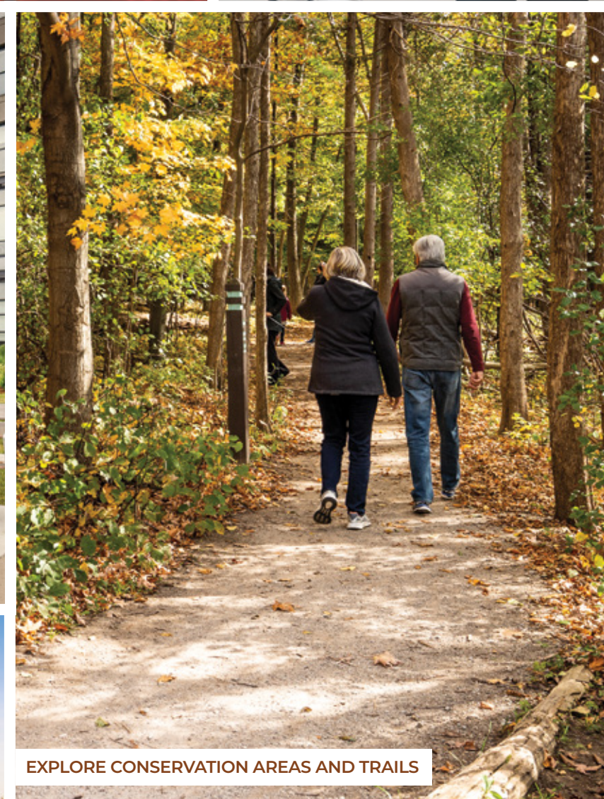
EXPLORE CONSERVATION AREAS AND TRAILS