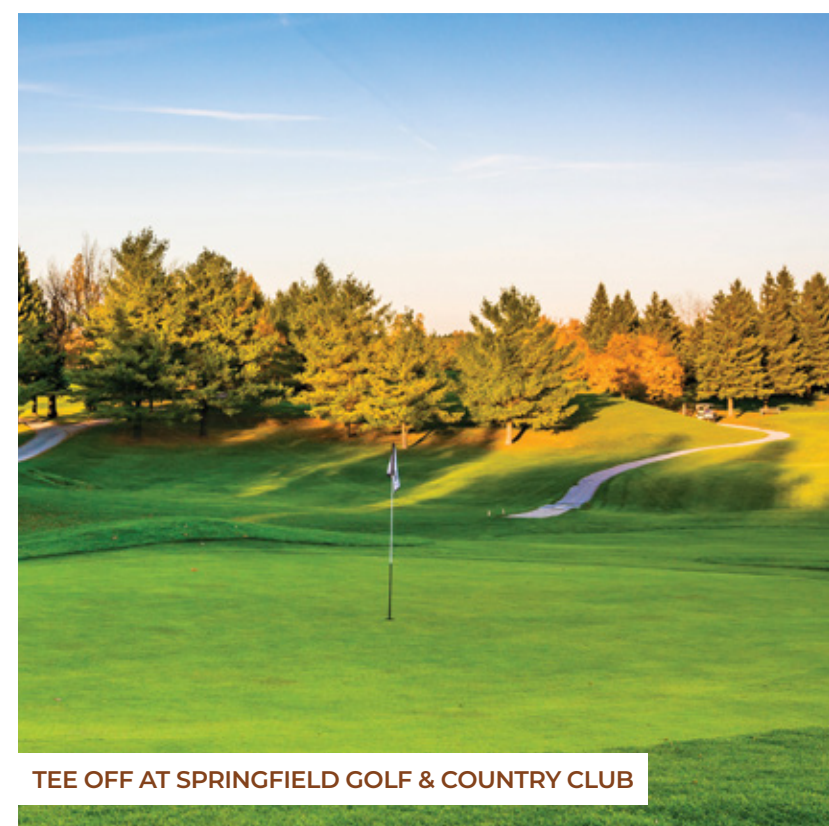
TEE OFF AT SPRINGFIELD GOLF & COUNTRY CLUB