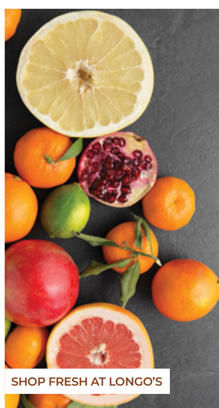
SHOP FRESH AT LONGO'S

WALK TO EVERYDAY AMENITIES IN UNDER 10 MINUTES