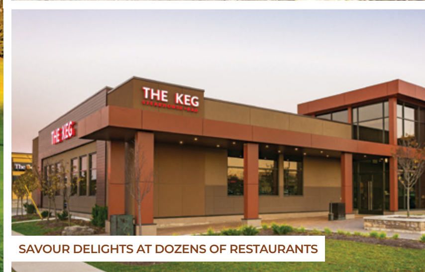
SAVOUR DELIGHTS AT DOZENS OF RESTAURANTS