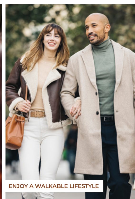
ENJOY A WALKABLE LIFESTYLE