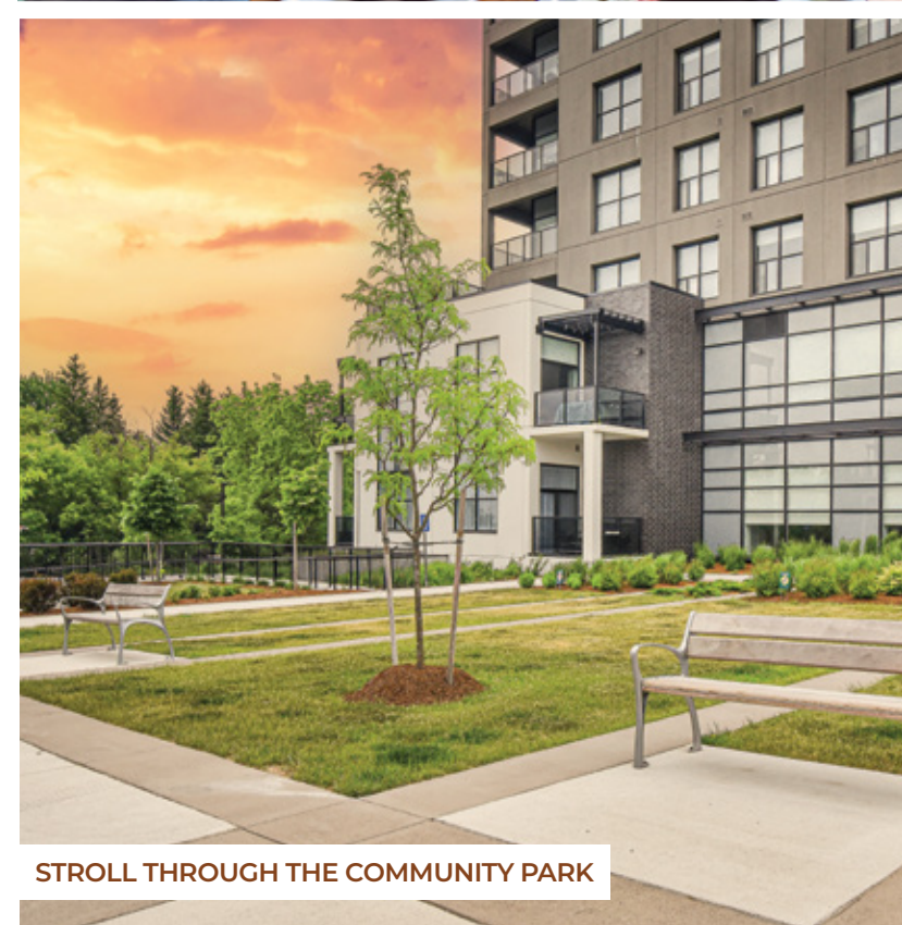
STROLL THROUGH THE COMMUNITY PARK