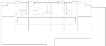
LOWER LEVEL 1