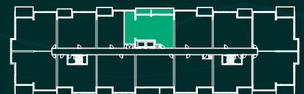
TYPICAL FLOOR (4-9)