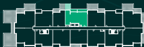
3 RD FLOOR