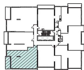
24TH FLR KEY PLAN